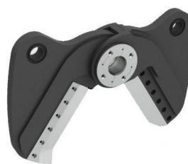
W Shear Wood Cut