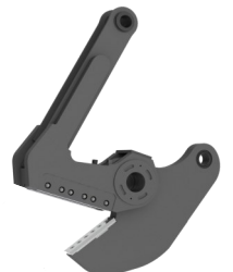
T Shear Tank and Plate Cut