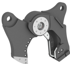
S Shear Iron Cut