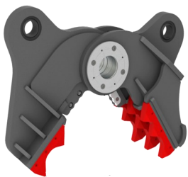
P Shear Concrete Crusher