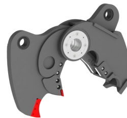
R Shear Combi Cut