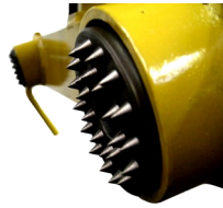
Steel Jaws Extra accessory

Type PZM-NJ for mechanical handling of barriers. Lifting eye for hook. Rubber jaws for protection of the concrete barriers. Steel jaws by request.