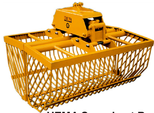
HEMA Sugarbeet Basket RK90-1250

As a special model, the basket can be delivered with closed shells, as well as welded blades for handling crops and similar materials.