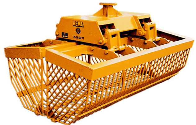
HEMA Sugarbeet Basket RK90-2500