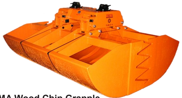
HEMA Wood Chip Grapple FG90-3000