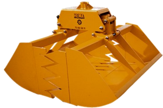
HEMA Wood Chip Grapple FG90-1250

All moving points are equipped with lubrication and replaceable bearings, which will make any potential reparation easy, fast and affordable.