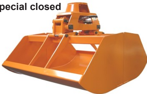
HEMA Wood Chip Grapple FG90-1250 Special closed