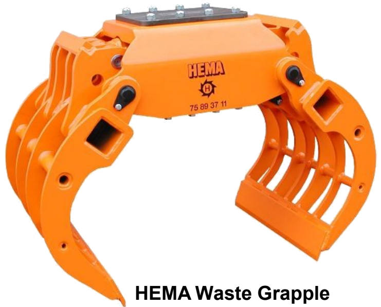
HEMA Waste Grapple AGX60/100-800

Please inquire our sales department for further information.