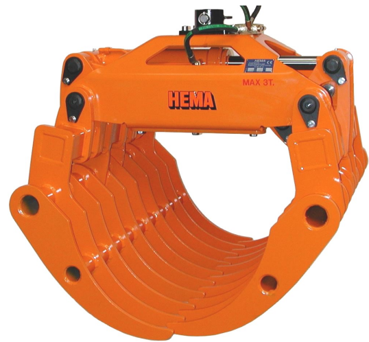
HEMA Waste Grapple AGS90-800

The S-waste can be delivered with other shell dimensions.