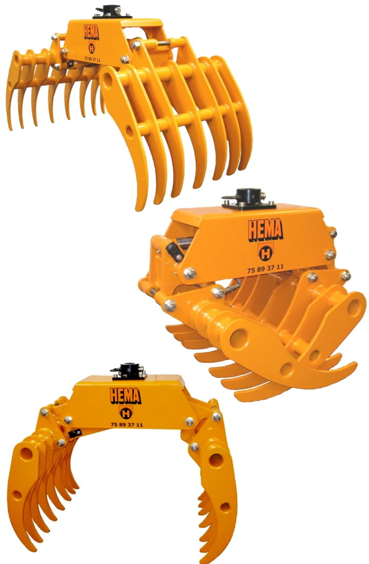
Waste Grapple AG90-600

The grapples can also be delivered as electric-hydraulic grapples.