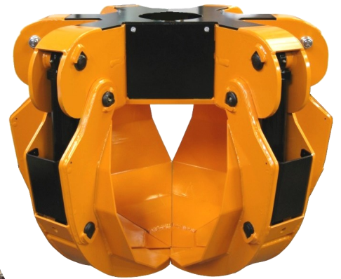
Poly Grapple PA 320/6

There are replaceable bushings and bearings in all moving points.