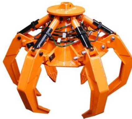
HEMA orange peel grapple Type P600 small arms