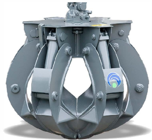
Orange Peel Grapple PFO-5/100