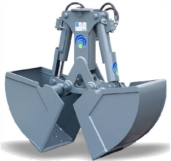
Excavator Grapple BMV- 2/500

The grapple is delivered with individual adjustment of bolt-mounted suspension for a rotator with a shaft.