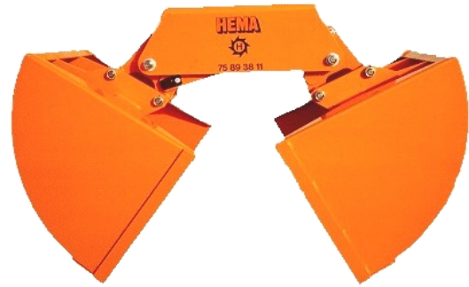
HEMA Soil Grapple HJ90-500

The grapple is delivered with individual adjustment of bolt-mounted link for a rotator with a shaft.