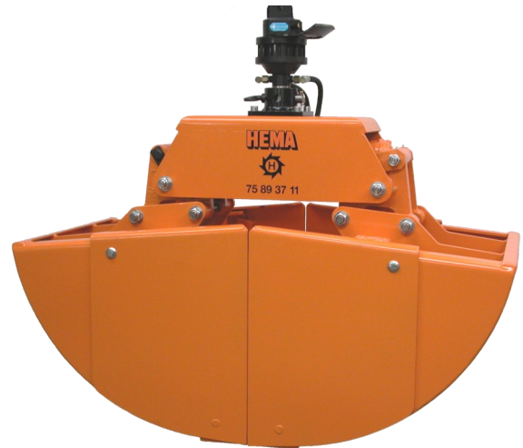
50-90 Combi Grapple with side plates